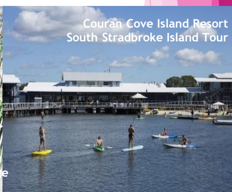
Couran Cove Island Resort South Stradbroke Island Tour