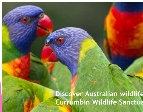
Discover Australian wildlife at Currumbin Wildlife Sanctuary