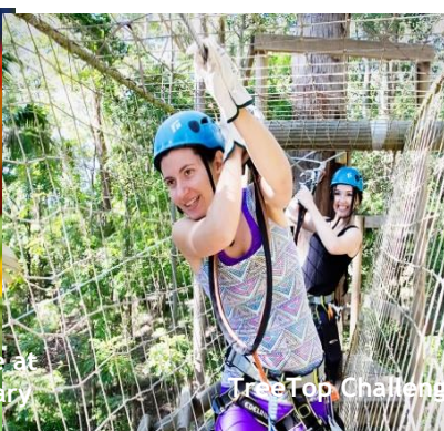
Tree Top Challenge