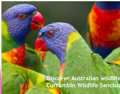
Discover Australian wildlife at Currumbin Wildlife Sanctuary