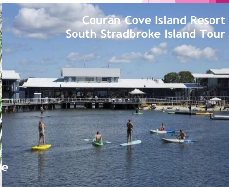
Couran Cove Island Resort South Stradbroke Island Tour