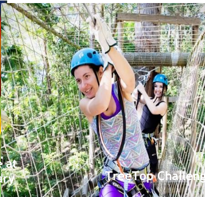
Tree Top Challenge