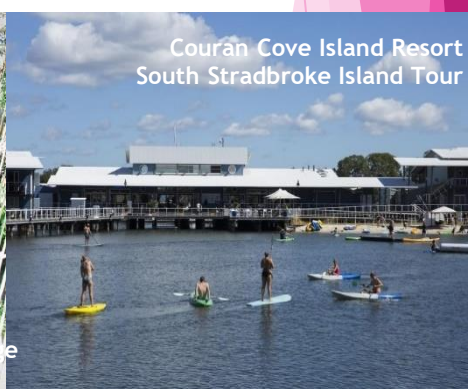
Couran Cove Island Resort South Stradbroke Island Tour