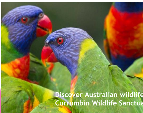
Discover Australian wildlife at Currumbin Wildlife Sanctuary